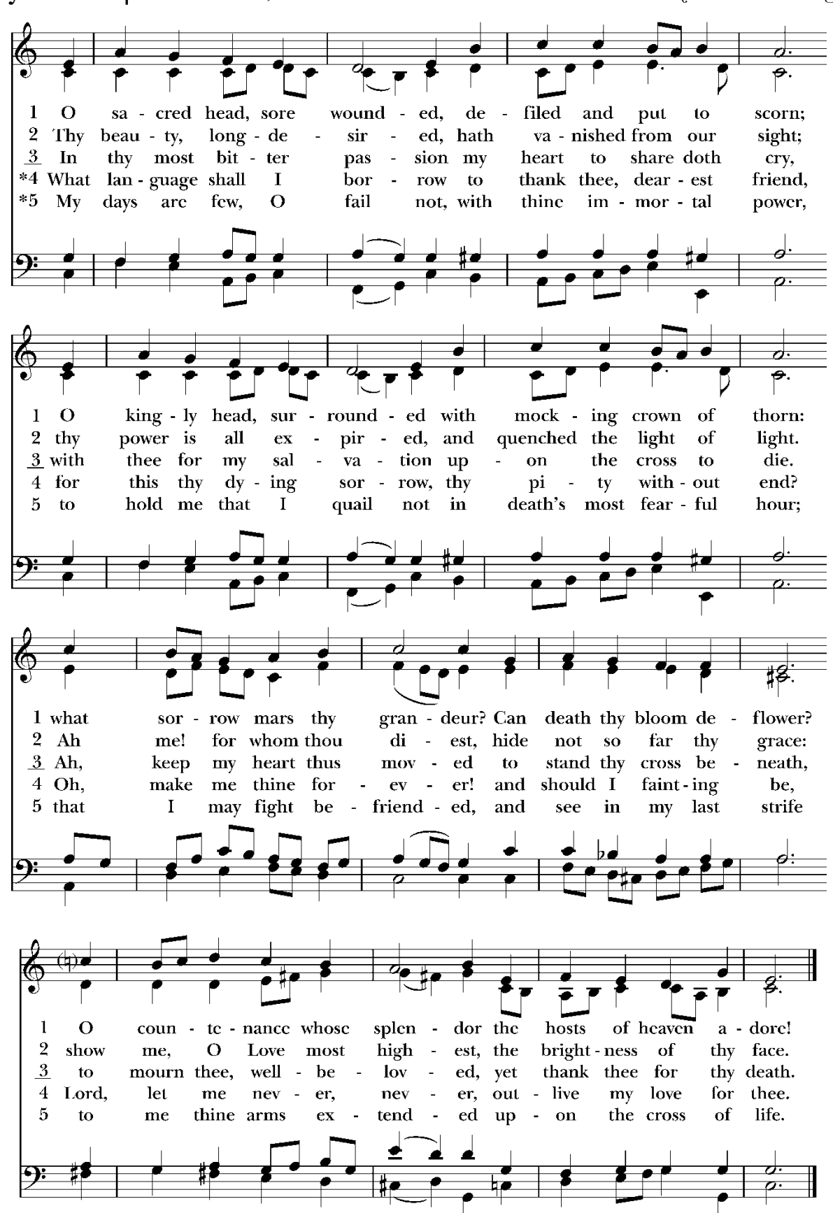
Herzlich tut mich verlangen